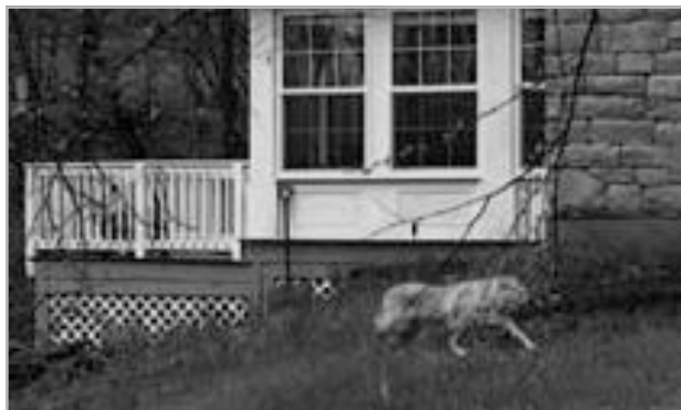
The Danby Bobcat has made another appearance, this time on Curtis Road!

On your way there—or on the way home—stop in at the Danby's Community Church Yard Sale! ❧