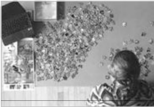
Life In The Times Of Coronavirus "Solving puzzles to the mellow online voice of Governor Cuomo."

Please contact me at [gayhuddle@hotmail.com] or 607.273.6530. ❀