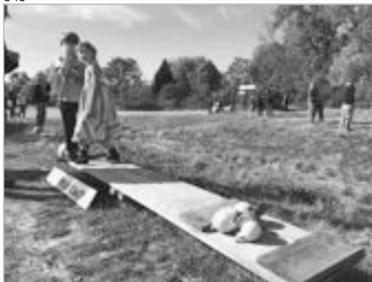
It takes more than two young folks to balance pumpkins! Harvest Festival 2019.