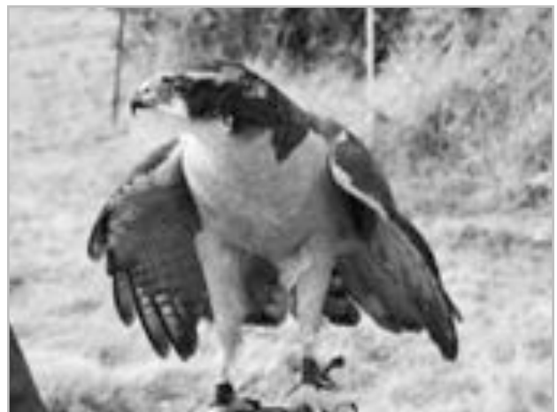
A Cornell Raptor at Harvest Festival