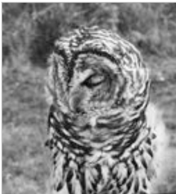
The Wise Owl. At Harvest Festival 2019.