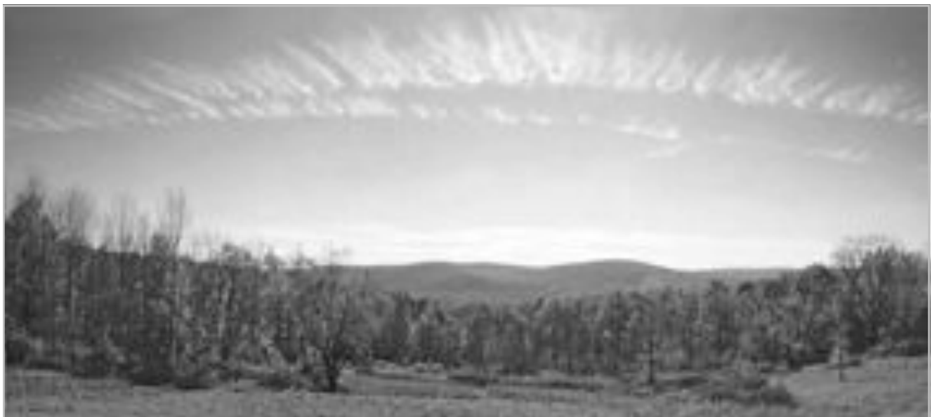
A Rainbow Of Clouds Over Slow Lane.