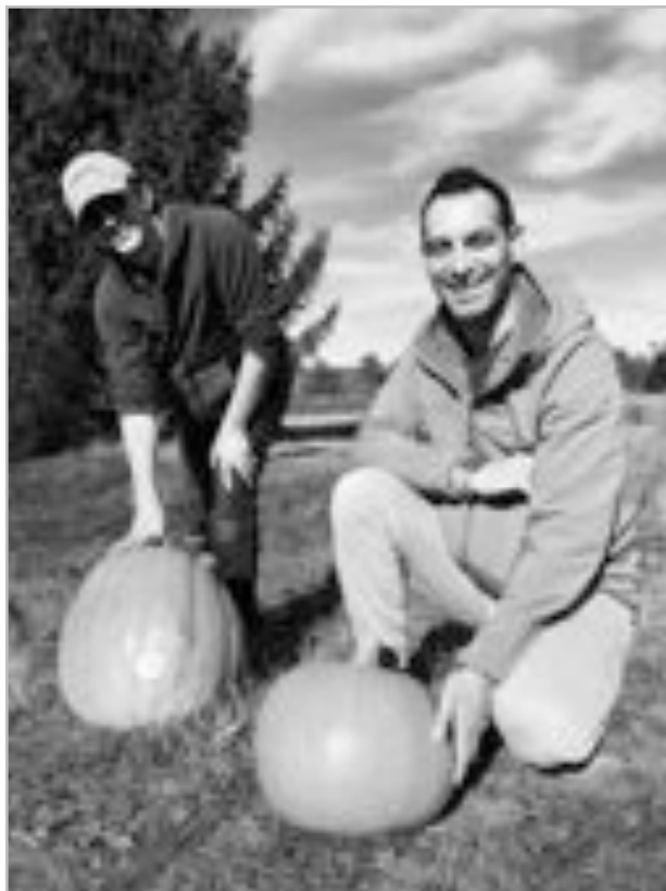
The Biggest and Roundest Pumpkins in the Big Pumpkin Contest. Harvest Festival 2019.