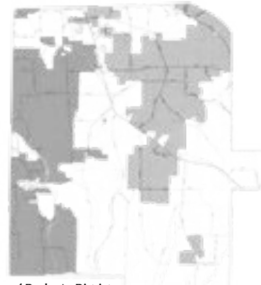
Town of Danby Ag Districts (#2 on left, #1 on right)

You can always reach us by phone, 607.277.4788 and by Email at [townclerk@townofdanbyny.org].