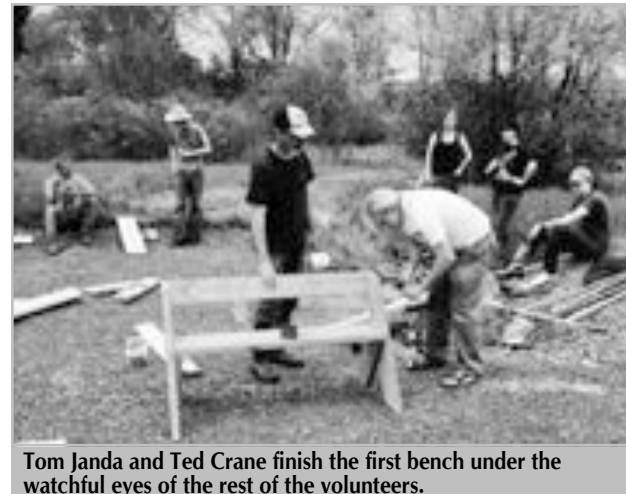
watchful eyes of the rest of the volunteers.

Come pull up a bench and check out the progress, try out the new boardwalk, and send us an Email, [dotsonpark@gmail.com], if you want to get in on the rest of the installation (happening later this month). It's your park!