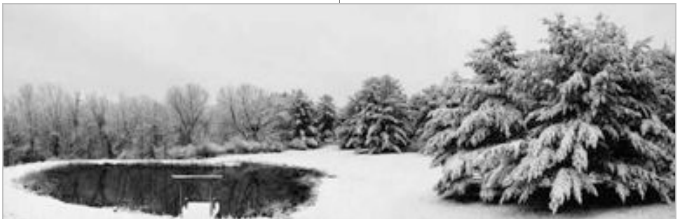
First light on first snowstorm.