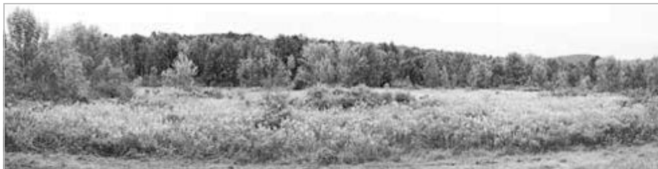
Goldenrod (imagine the color, please).