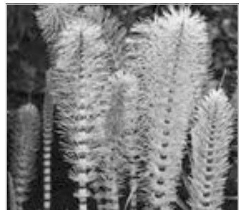
Horsetail, see page 5