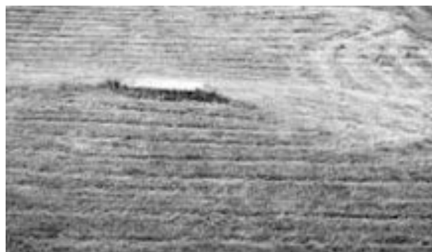
Mowing Season Is Here