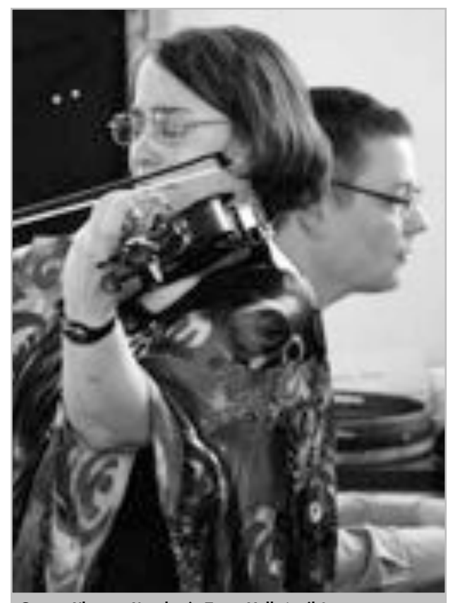
Cayuga Klezmer Kapelye in Town Hall, April 9.

This list may not be complete. If you have a photo of those honored, we would appreciate a copy. If you have any comments, corrections or additions, please contact [edwk@lightlink.com]. It would be good to develop more information on each of our past volunteers. $