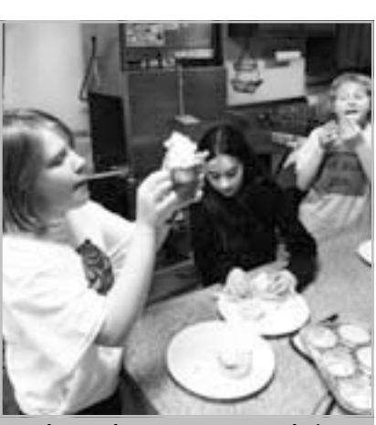
Danby Youth Learn To Be Iron Chefs

The Department of Environmental Conservation (DEC) reminds New Yorkers that, with warming temperatures and dry conditions, residential brush burn-