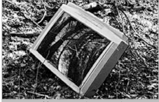
JVC 36" TV, Model #AV-36D503, circa 2002. Hoping to return to rightful owner. Please contact Tompkins County Sheriff's Dep't.