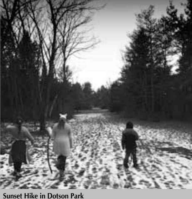
iiset Tiike iii Dotsoii Taik

The weekend is designed to showcase the need for volunteers, not just here in Danby but in all the Volunteer Fire Companies statewide. There are many different types of volunteer positions; stop down and check us out! There will be fire related games, great BBQ and much more.