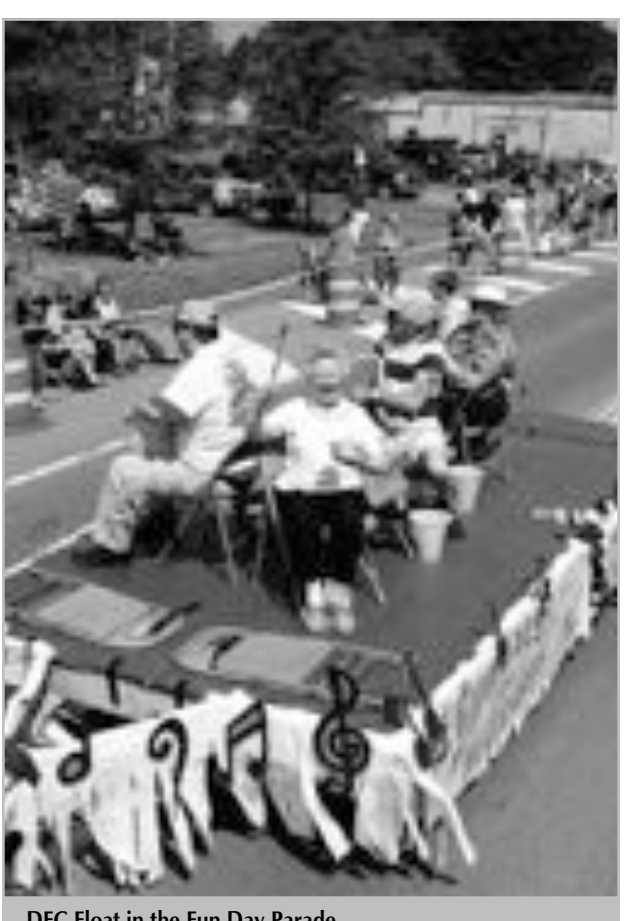
DFC Float in the Fun Day Parade

The details of the celebration are still not worked out but the public will be invited for snacks, drinks, and an opportunity to visit the tank. Details will be posted sign boards when they are finalized and postcards will be sent to the district's residents.