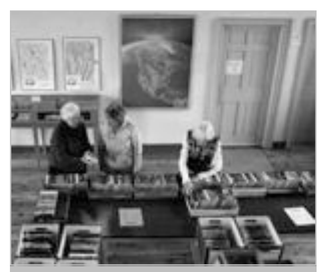
Volunteers preparing for the Danby Community Library's annual Book Sale. The event is fundraiser for the library. This year, the Book Sale also offered several pieces of office furniture and equipment for sale to benefit the library...and some of it is still available in the Town Hall foyer!

Four new Danby youth are stepping up to become lifeguards! Watch the Town Sign for our opening date!