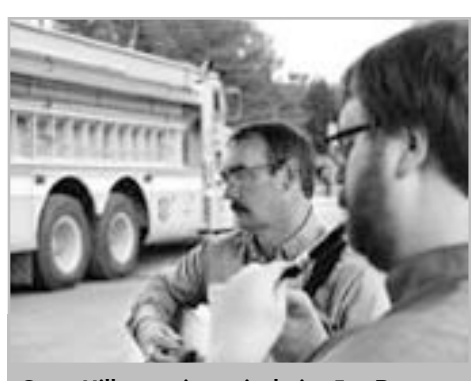
Crane Hill acoustic music during Fun Day

Tompkins County has implemented a digital records archiving program and is now able to host a solution for use by other local government agencies. External users may utilize a secure Internet connection or a locally-managed