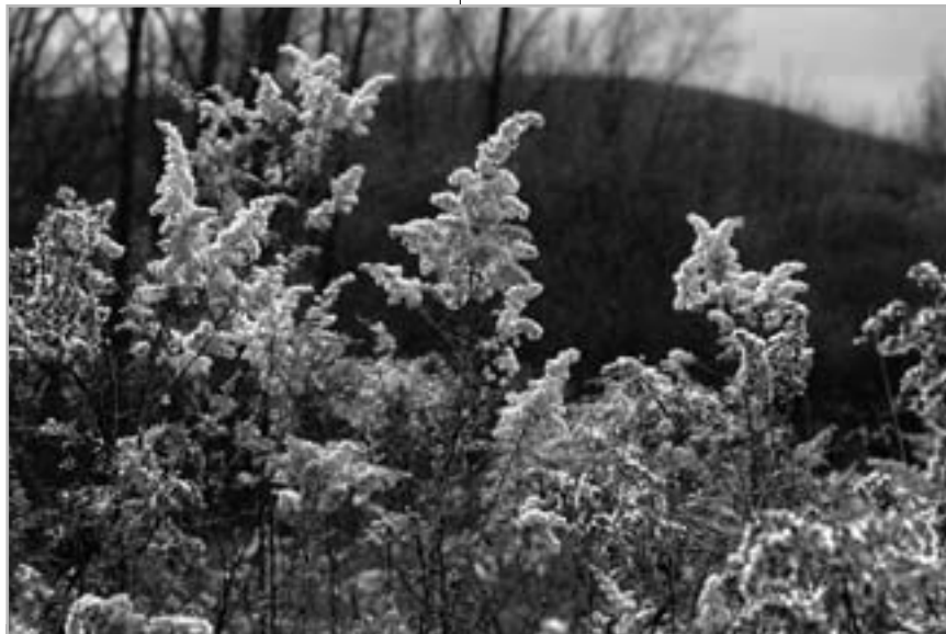
Glowing Goldenrod—The clear light of a crisp fall day restores the glow, tho' not the vibrant color, to brushy fields.

A small mouse that has been poking its nose out of a hole in a tree to greet a group of young people every Wednesday this Fall...took an apple piece from us...then one week its hole was packed tightly with rabbit fur...we