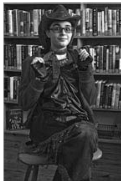
Ghouls, goblins, angels, cowgirls, skeletons, cider lovers, and ink drinkers at the Community Council Halloween Party!