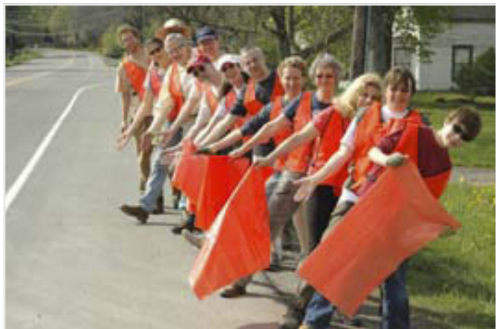
Danby Democrats, along with other groups, picked up roadside trash along miles of highway in both Danby hamlets.

Come explore the wide variety of summer and fall-blooming bulbs we can grow. Summer Bulbs will take place Wednesday, June 2, 6:30-8:30pm in the Tompkins County Cooperative Extension Education Center, 615 Willow Avenue, Ithaca. Fee: $5; pre-registration requested. Please call 607.272.2292 for more info. ❁